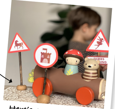
Here's some we made!